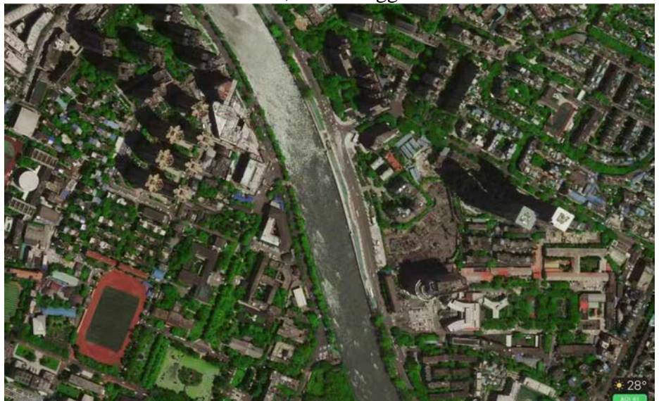
Fig.1 Location of Wenli District

The Yuwenli community is located within the east gate of the Wangjiang Campus of Sichuan University, 150 meters away from the Sichuan University Affiliated Primary School and 1.4 kilometers away from the Sichuan Conservatory of Music Affiliated Primary School (as the figure shows below). In terms of resident composition, the residents of the district are all faculty and staff of Sichuan University, and the group's original housing before moving into the Yuwenli district were all in the school district of Sichuan University Affiliated Primary School. After Sichuan University demolished the old building in 2016 and built the new Yuwenli District, the residents found that the school district they belonged to had changed. In response, the residents launched a series of advocacy actions for the university office and the Education Commission, which triggered attention of social media.